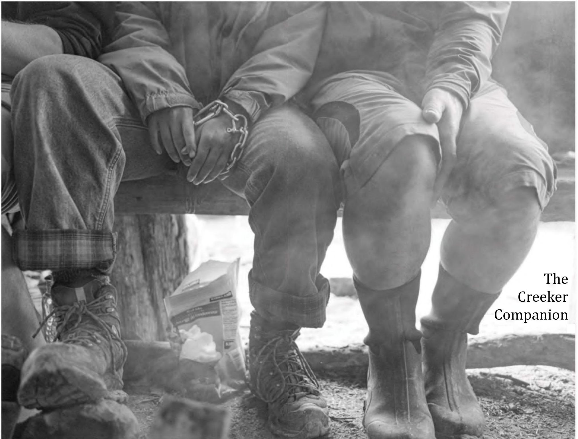
The Creeker Companion